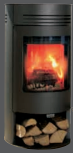
Aduro 1 with wood tray