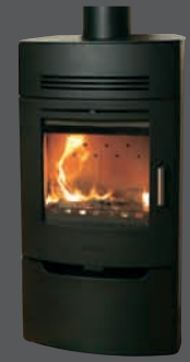
Aduro 3 with drawer